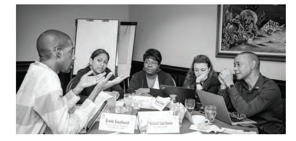
Representatives from professional accountancy organisations (PAOs) in the Caribbean share their experiences and challenges with implementing SMO 1 and SMO 6 during the Consultative Meeting & Capacity Building Workshop hosted by the ICAC in collaboration with IFAC.